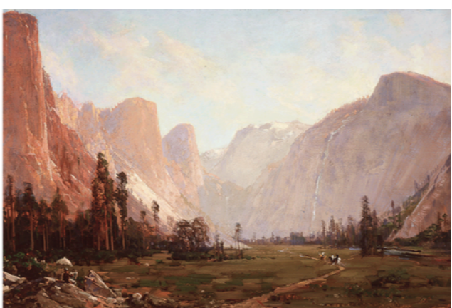
Spiritual Geographies: Religion and Landscape Art in California, 1890–1930 Opens March 2, 2024

Spiritual Geographies explores the relationship among nature, landscape art, and religion in California from the 1890s to 1930. The exhibition considers how the geographical nature of landscape painting lent itself to spiritual meanings that were conveyed and circulated within religious printed materials of the time. As readers and writers of this devotional literature, California's leading impressionist and early modernist artists painted landscapes that reflected both traditional and progressive spiritual ideas, contributing to the national perception of California as a place tolerant of experimentation and individual expression.