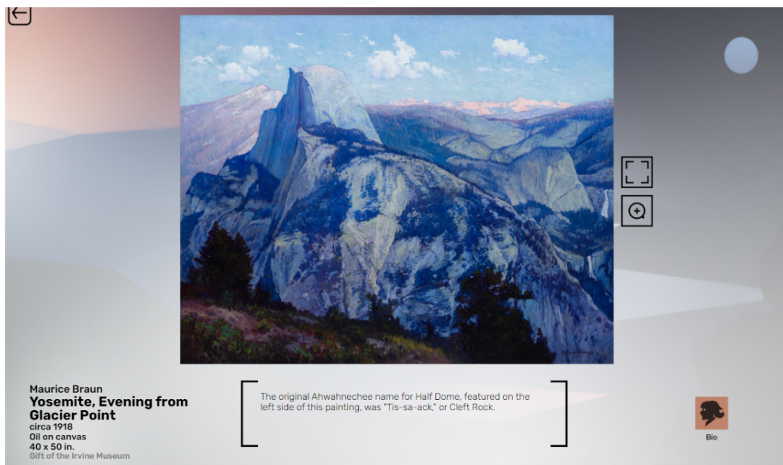
Maurice Braun Yosemite, Evening from Glacier Point circa 1918 Oil on canvas 40 x 50 in. Gift of the Irvine Museum

The original Ahwahnechee name for Half Dome, featured on the left side of this painting, was "Tis-sa-ack," or Cleft Rock.