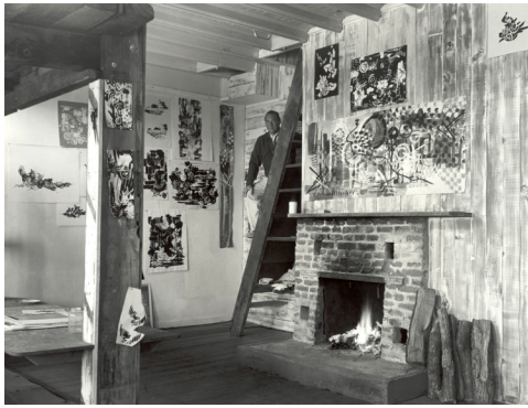
Gordon Onslow Ford in his studio on the Ferryboat Vallejo in 1956.