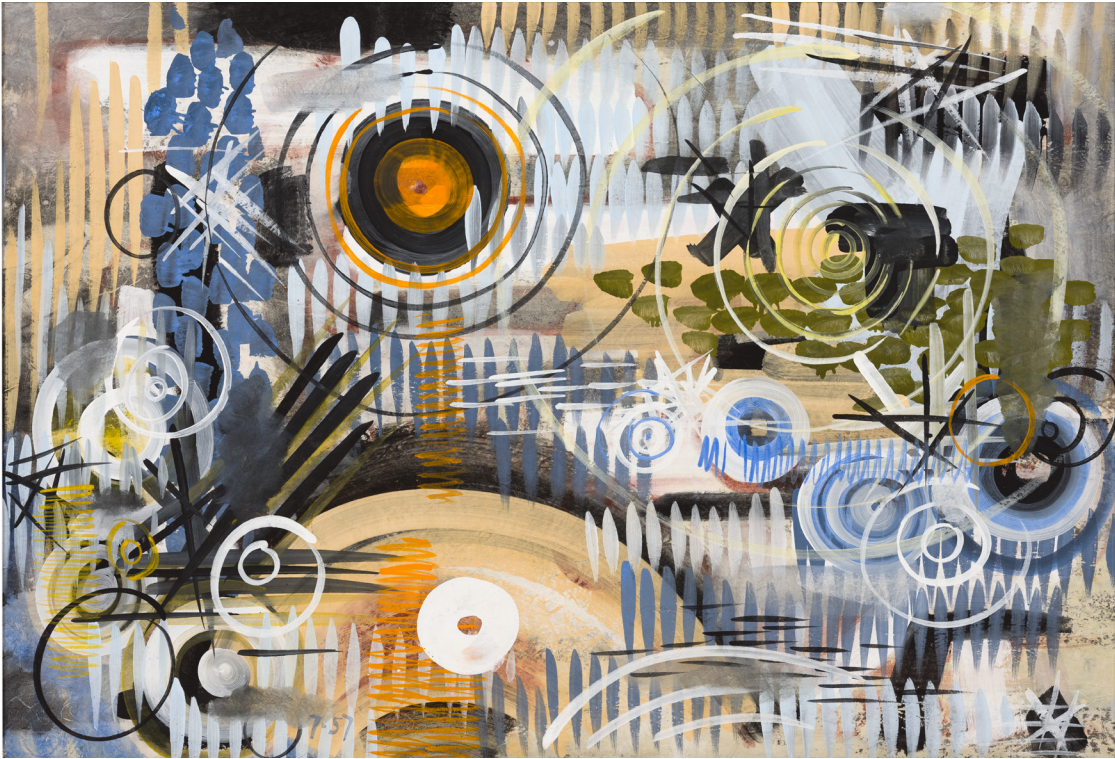
Gordon Onslow Ford, Constellations and Grasses , 1957, Casein on mulberry paper, 38 x 56 in. The Buck Collection at UCI Institute and Museum of California Art, © Courtesy of the Lucid Art Foundation