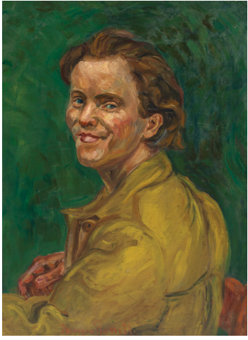
Morgan Russell, Morgan Russell Self-Portrait , circa 1907, Oil on canvas. 27 x 21 in. National Portrait Gallery, Smithsonian Institution; gift of Howard Weingrow, © Estate of Morgan Russell