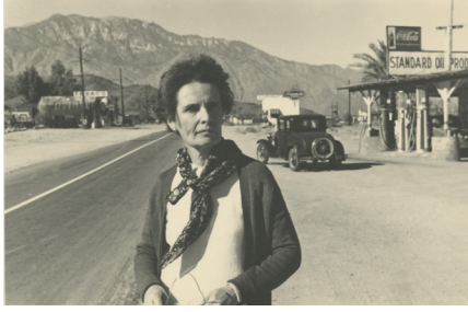
Agnes Pelton photographed in 1932 in Cathedral City, CA. Mount San Jacinto in the background.