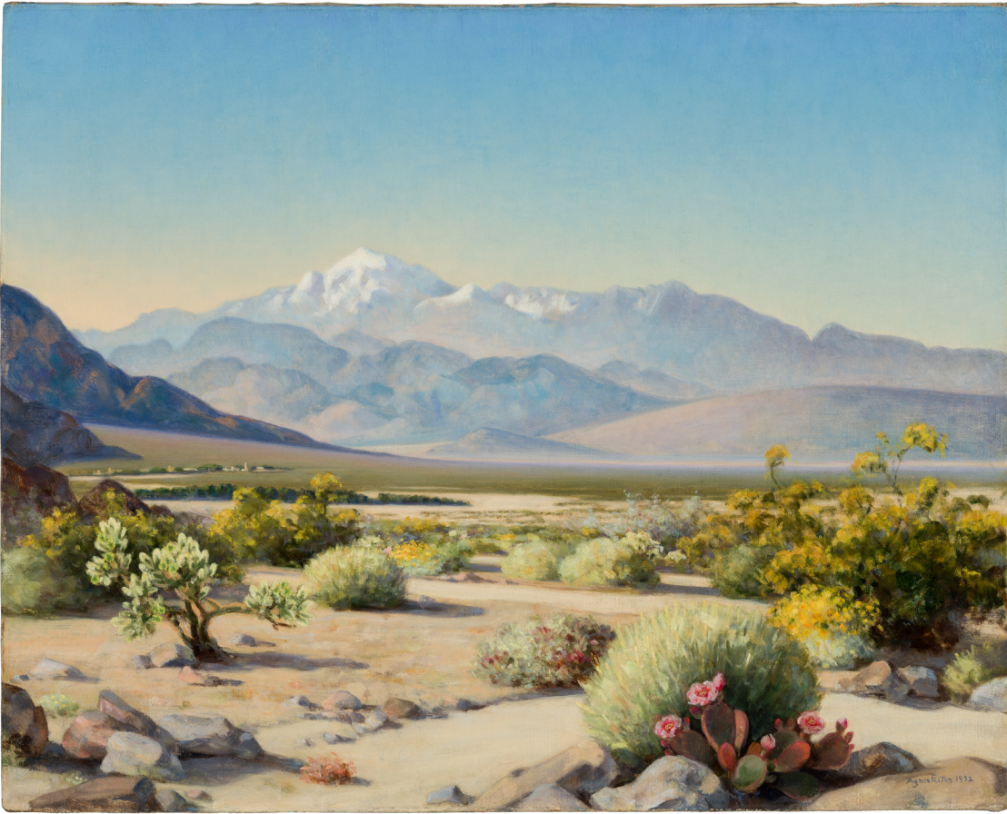
Agnes Pelton, San Gorgonio in Spring , 1932, Oil on canvas, 24 x 30 in. The Buck Collection at UCI Institute and Museum of California Art